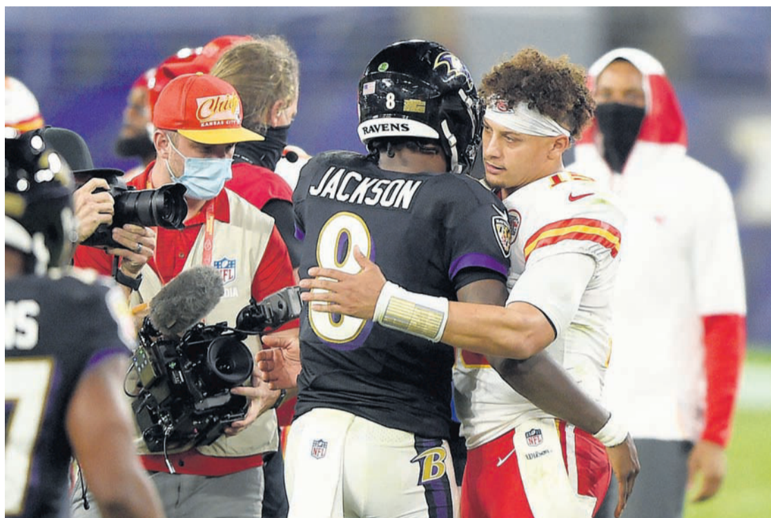
Baltimore Ravens quarterback Lamar Jackson, center, and Kansas City Chiefs quarterback Patrick Mahomes, right, embrace after an NFL football game, Sept. 28, 2020, in Baltimore.

Of course not. Nothing is certain when it comes to talent evaluation, fulfilling potential